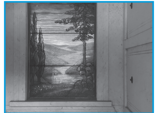
A stained glass window in the Gillespie mausoleum