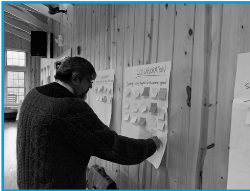
Council leaders used a retreat at Pine Springs Camp in May 2022 to refine ideas for the strategic plan

The 2023-2028 strategic plan includes 3 strategic priorities, 11 goals, 50 strategies, and 151 action steps. The priorities and goals are as follows: