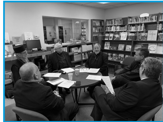
A group of Council leaders gather at Beaver-Butler Presbytery to refine the plan's action steps in March 2023