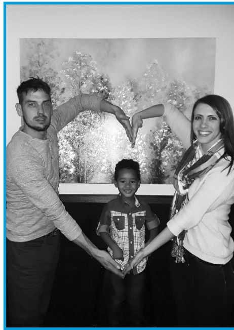
A foster family served by Adoption Connection PA

Adoption Connection, PA is a faith-based nonprofit foster care and adoption agency serving western PA. We want to partner with your congregation through our One Church One Mission program that teaches and empowers churches about making a difference through recruiting foster families, surrounding a foster family with love and prayer,