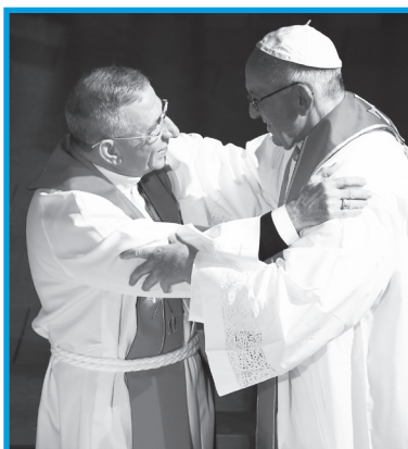
Bishop Munib Younan, President of the Lutheran World Federation, embraces Pope Francis as global joint commemorations of the Reformation begin.