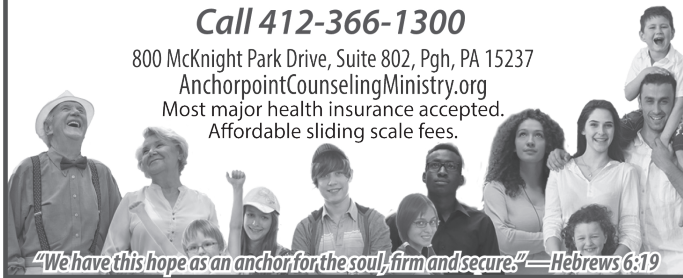
"We have this hope as an anchor for the soul, firm and secure." —Hebrews 6:19

800 McKnight Park Drive, Suite 802, Pgh, PA 15237 AnchorpointCounselingMinistry.org Most major health insurance accepted. Affordable sliding scale fees.