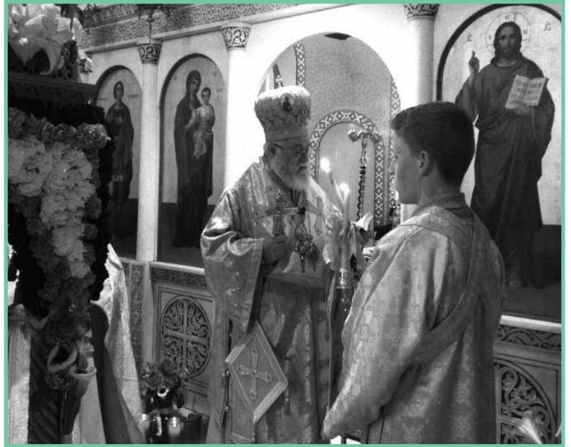
Holy Friday at St. Demetrios Greek Orthodox Church in Warren, Ohio