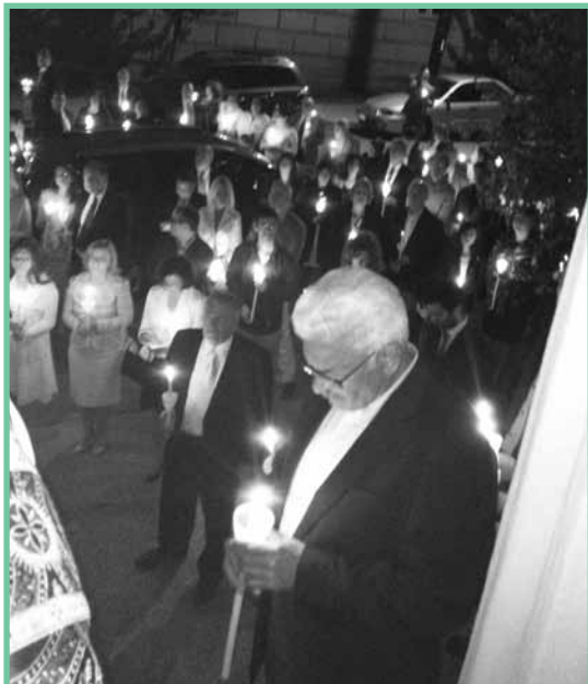
Paschal Vigil at St. Nicholas Greek Orthodox Cathedral in Pittsburgh

Hierarchs of Christian Associates other Orthodox communions celebrated Jesus death and resurrection with similar rites throughout their respective dioceses.