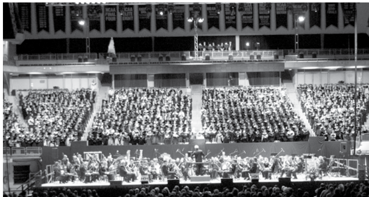
Music for the Spirit filled the Petersen Event Center on April 20