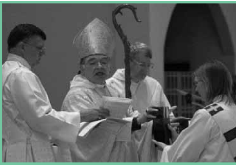
Archbishop Robert Duncan blessing Oil of the Sick