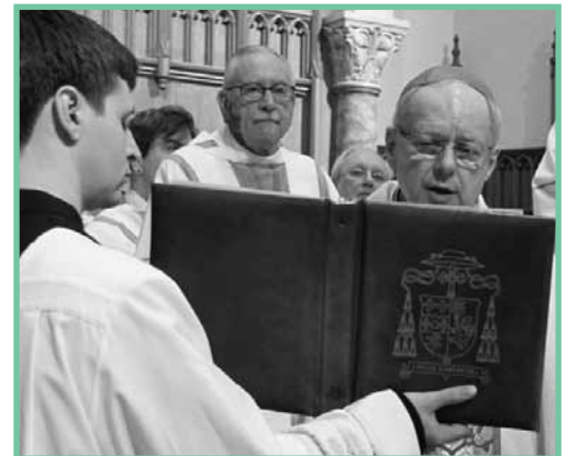
Bishop Brandt blessing Oil of the Sick