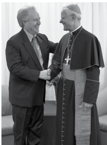
Archbishop Wuerl with Manfred Honeck

Classified Advertisements may be placed at a PREPAID cost of $10.00 for 40 words or less. The publication of ads/events does not indicate specific endorsement of an organization, ad or event, and is strictly of an informative nature. The DEADLINE for all submissions is the 15th of the month prior to the issue the submission is to appear (August 15th for the September issue). Photographs, articles and other submissions about the local church are welcome.