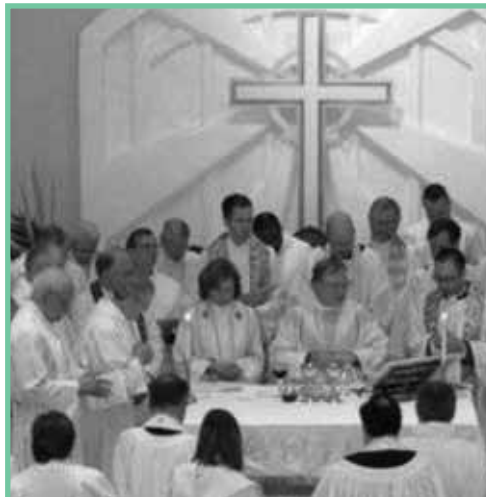
Archbishop Duncan and clergy concelebrating the Eucharist