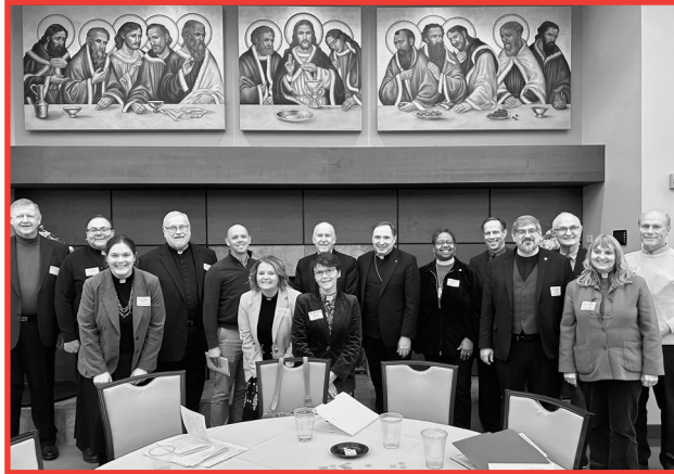
Many of the book's contributing authors attended the release party for We Believe: A Devotional Book for Nicaea 1700

The event also featured the launch of Christian Associates' latest publication. We Believe: A Devotional Book for Nicaea 1700 contains twenty-eight reflections from bishops, pastors, deacons, and theologians from all over Southwest Pennsylvania. The selections, as varied as their authors, each include concluding questions for group discussion and individual reflection.