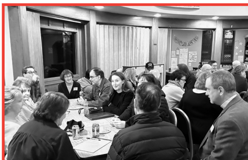
Christians gathered in October to explore the Reckoning with Antisemitism program's options for 2025-6.